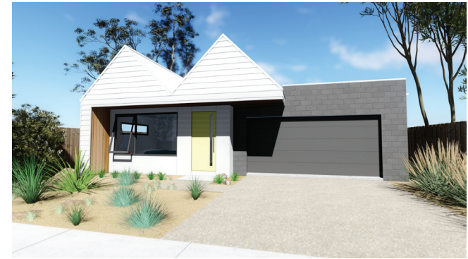
the boat house